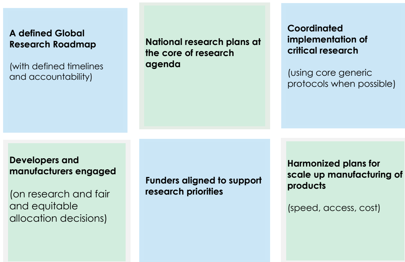
Figure 2. Key components for successful implementation of the Global Research Roadmap

One challenge is how to handle the greater uncertainties associated with research during this outbreak. The potential acceptability of different risks will vary, depending on numerous factors including the type of research and the context in which it takes place.